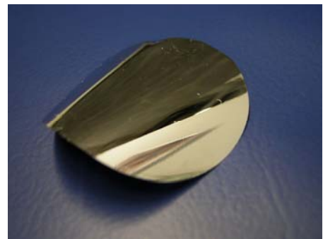
Fig. 2: free-standing Ni/Al-RMS